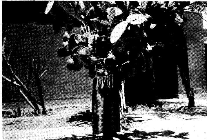
el-Haraniya, Cairo, Egypt, 1985.

I am focusing so far on some Islamic tenets because all the ills of Muslim societies are generally blamed upon it. Furthermore, as I stated above, religion is grossly misused in Muslim countries to legitimize practices not condoned by the Qur'an. I find it ironic that those who purport to go to the fundamentals of Islam somehow always miss the Holy Text and seem to focus only upon medieval interpretations of that Text. And when they invoke the Text they only seem to see its punishing injunctions. Nowhere is this more obvious than in the application of the 1979 Hudood