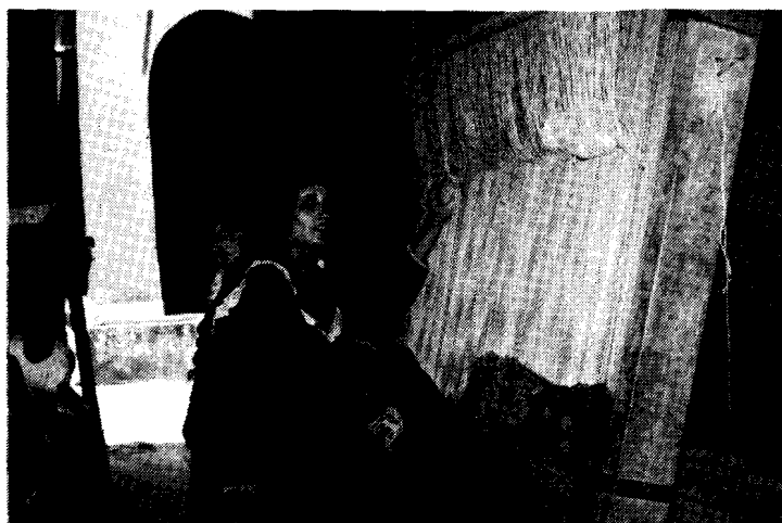
el-Haraniya, Cairo, Egypt, 1985.

The backlash against women in Muslim countries is part and parcel of the global right wing backlash that we are currently witnessing. It is the fruit of the disturbing