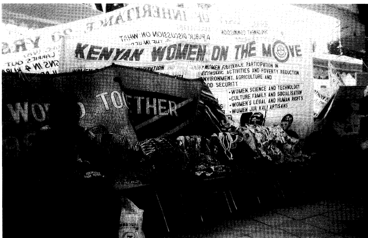
Participant in Huairou, NGO Forum 1995.

"Reform Assails Refugee Policy." Globe and Mail 17 January 1995: A4.