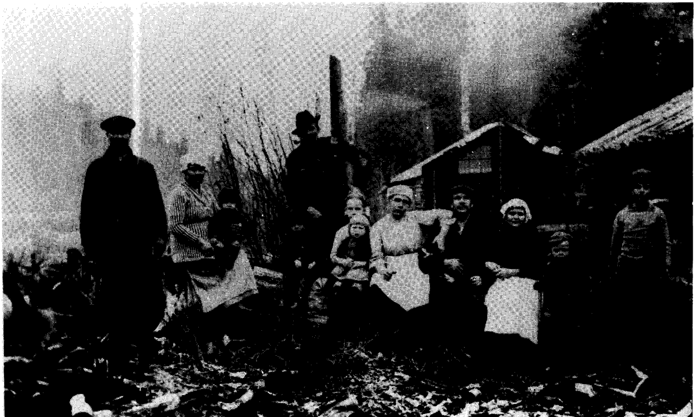
Finnish pioneers clearing the bush north of Port Arthur, 1905.