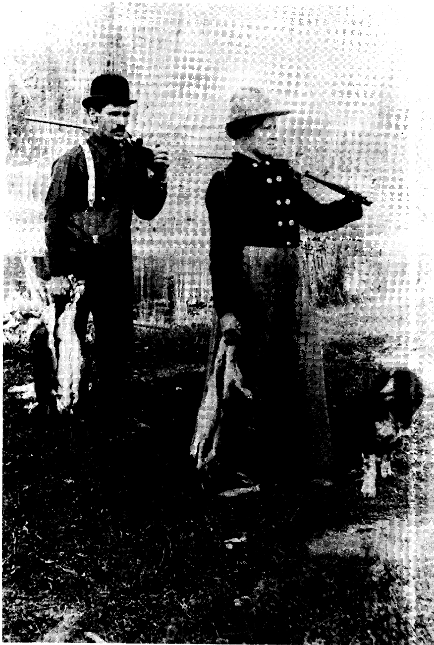
Finnish women were well recognized for their hunting skills. Northern Ontario, c. 1900.