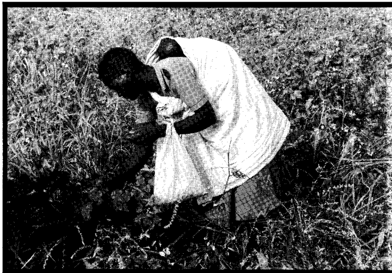
Mozambican refugee mother and child in Zimbabwe camp

proposed by the women themselves (such as girls schools, training of traditional birth attendants, improved sanitation facilities located at a safe distance from dwellings, introduction of farming activities and of semi-mechanized looms to supplement family income through traditional weaving skills). In societies where strong cultural constraints govern the role of women and their access to facilities, identifying and meeting the needs of vulnerable groups of refugee women can prove extremely difficult, as has been found to be the case in Afghan refugee