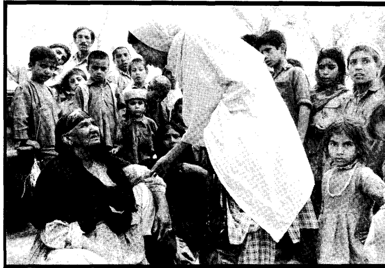
Afghan refugees in Pakistani camp

and psychological vulnerability. In many refugee situations, a major problem is the inability of women to free themselves from their daily tasks long enough to attend to their own health needs. In some cases, traditional nutrition and sanitary practices are inappropriate, or impossible to follow in a refugee camp or settlement with a concentrated population. Cultural barriers may also restrict women's access to health care. In UNHCR's largest country program, difficulties have been experienced in bringing medical and nutritional care to female Afghan refugees.