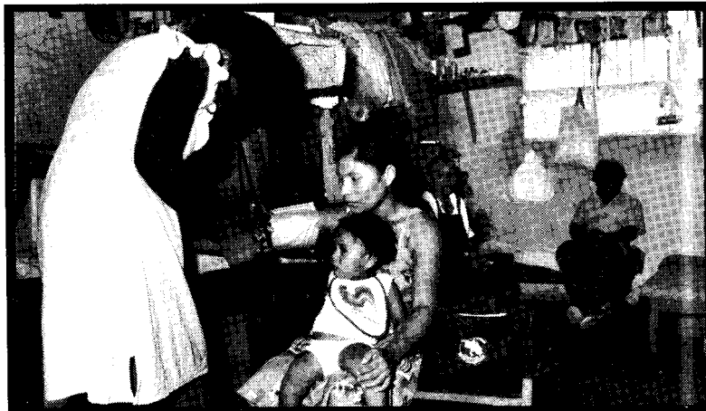
Nicaraguan refugees in Costa Rican centre

a prominent role in promoting the interests of refugee women. At the NGO International Consultation on Refugee Women held in Geneva in November 1988, the Canadian delegation consisted of seven women, three of whom are refugees now living in Canada. Refugee women at the Conference met with UNHCR's Deputy High Commissioner. The participants at the Consultation called on the international community, governments and voluntary agencies to change their "charity mentality" and recognize refugee women as individuals with specific needs who